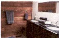
Full bathroom 2