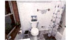
Full bathroom 1