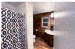
Full bathroom 3